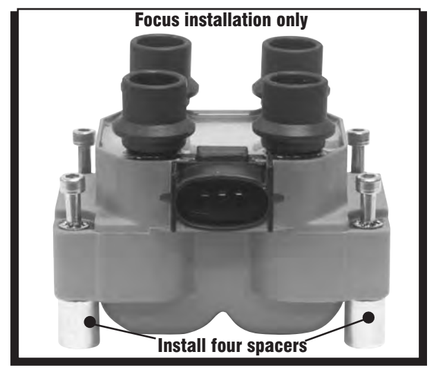
Figure 2 Coil Installation on a Focus Zetec.