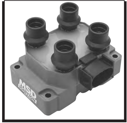
Figure 1 The MSD Ford 4- Tower Coil Pack.

WARNING: High Voltage is present on the coil terminals. DO NOT touch the coil terminals or tower when the engine is cranking or running.