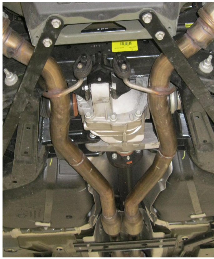
Step 1. Begin by removing the two front crossmembers and the two rear chassis stiffeners by the muffler inlets. This will allow access to the exhaust system.