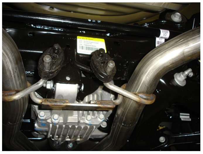
Step 2. To remove the OEM exhaust loosen the two bolt clamps located behind the catalytic converters. Working rearward disengage the rubber inulators from the welded hangers, retain clamps and rubber insultors as they will be used to install the new system. Remove complete system.