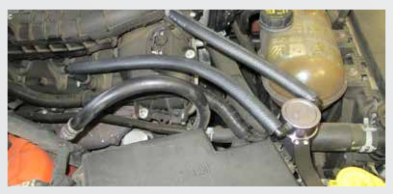
Remove factory PCV hose then install Oil Separator Kit as shown in picture. Making sure the shorter hose goes to intake manifold/draw side.