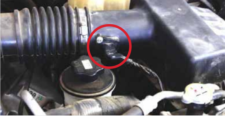
Disconnect the Mass Air Flow (MAF) Sensor.