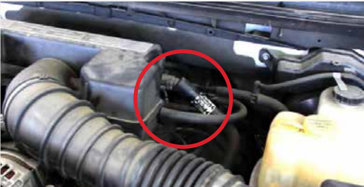
Remove the two vent hoses going into the factory intake system.