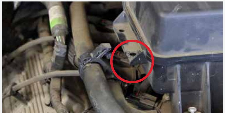
Loosen the two 10mm mounting bolts that secure the factory intake system to the vehicle. Also remove the clip on the passenger side of the stock intake system using pliers.