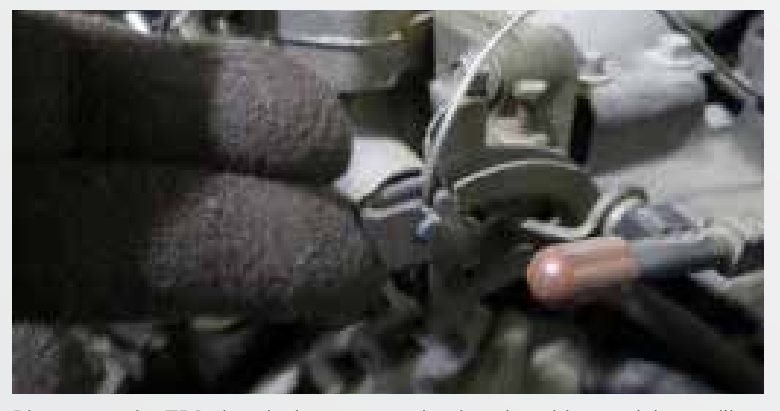
Disconnect the TPS electrical connector, the throttle cables, and the auxiliary return spring (if equipped) from the stock throttle body.