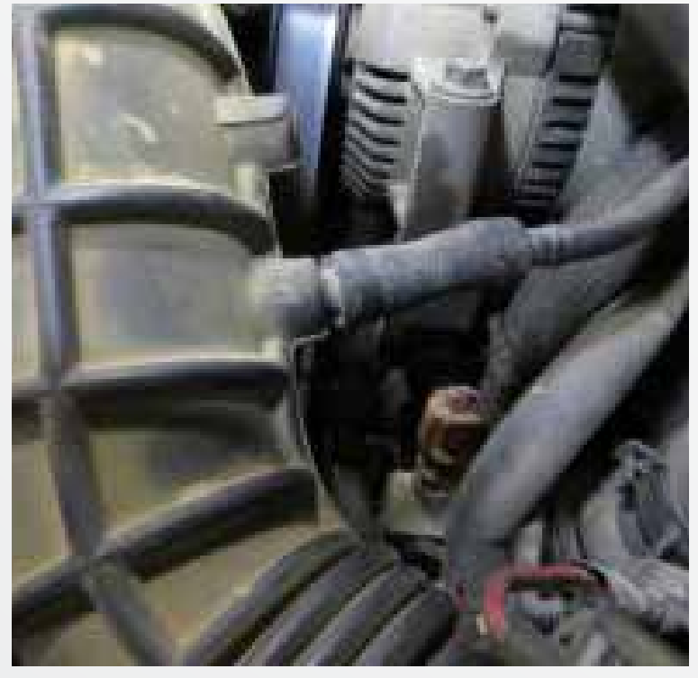
Unclamp the air filter inlet tube from the neck of the throttle body. Disconnect the breather tube and move air filter inlet tube to the side.