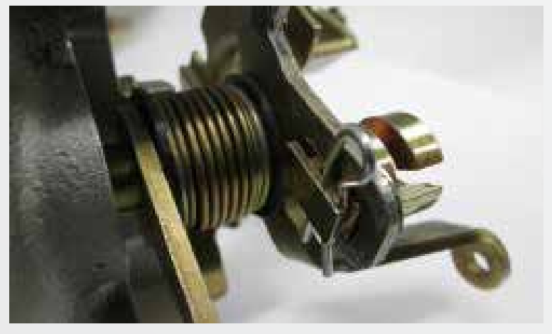
NOTE: On Ford Ranger only Install the throttle cable adapter with the open slot end facing down and install the safety clip onto the back side of the adapter.

Reconnect the negative battery terminal and start the engine. Make sure the vehicle is idling properly. Idle can be adjusted by turning the 5mm set crew either clock-wise or counter clock-wise.