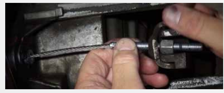
Reattach the cable to the quadrant assembly first, then to the clutch fork. To adjust the cable, simply twist the knurled adjuster either cw or ccw to loosen or tighten cable.